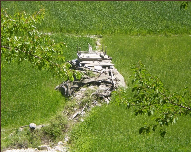
Gasguru Mand'aw jaw

Human hazards are very common, the asset are facing challenges such as encroachment in above picture etc.