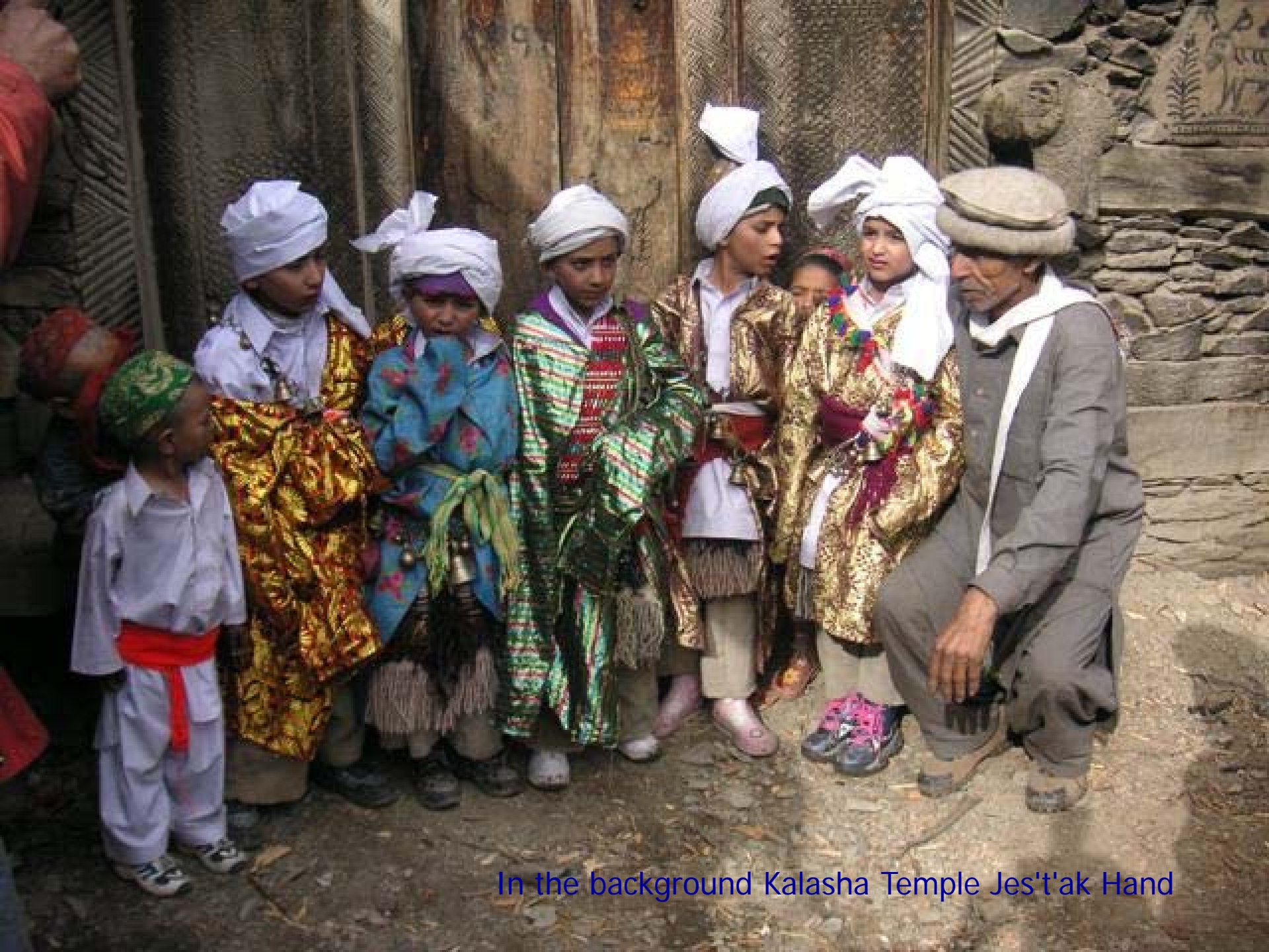
In the background Kalasha Temple Jes't'ak Hand