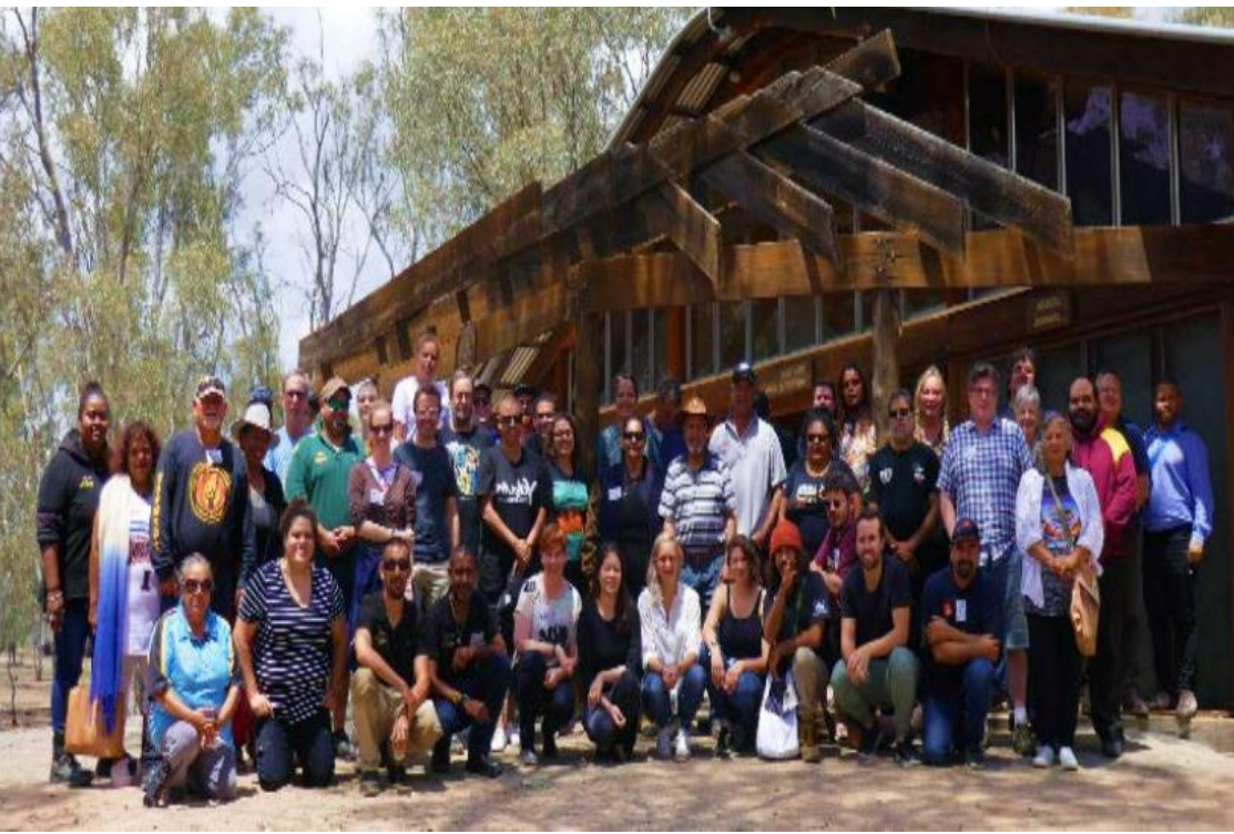
National Indigenous Dialogue on Climate Change participants @ Barmah National Park on Yorta Yorta Nation Country.

We at the Gathering are calling for the following: Indigenous-led adaptation planning for communities and the recording and transmission of knowledges and experiences across the country.