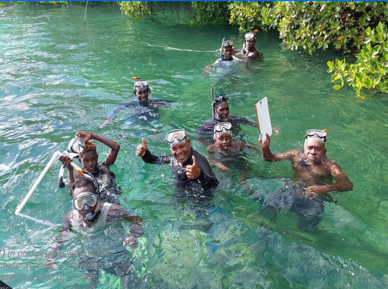
Climate Resilient by Nature (DFAT) in partnership with WWF Au and WWF-Pacific Solomon Islands, scaling sustainable Seagrasses Management and Protecting Critical Climate Ecosystems