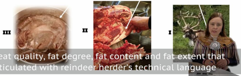
of meat quality, fat degree, fat content and fat extent that is articulated with reindeer herder's technical language