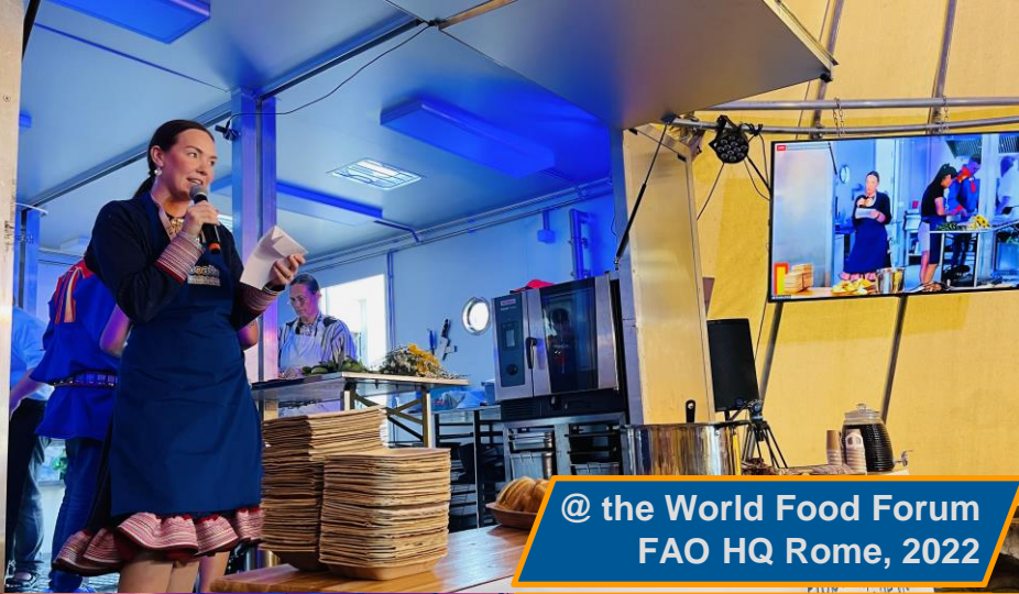
@ the World Food Forum FAO HQ Rome, 2022