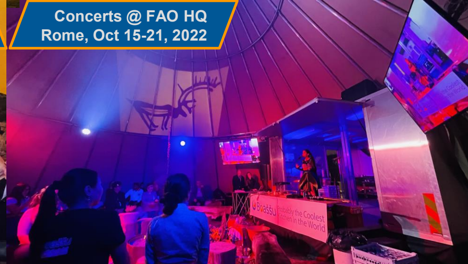
Concerts @ FAO HQ Rome, Oct 15-21, 2022