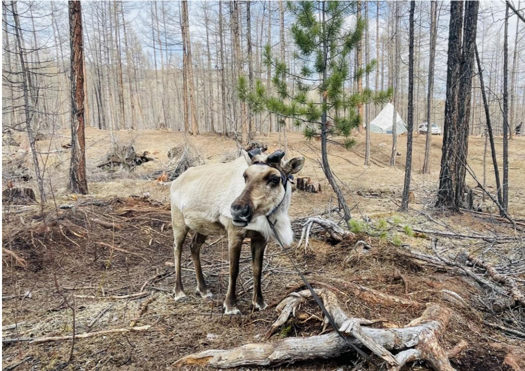
Pic: Dukha reindeer herding in Mongolia. June 3, 2023.

Enhancing the Resilience of Reindeer Herders' Ecosystems and Livelihoods