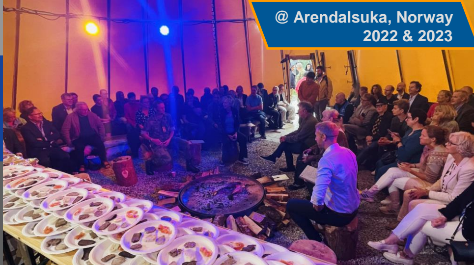
@ Arendalsuka, Norway 2022 & 2023