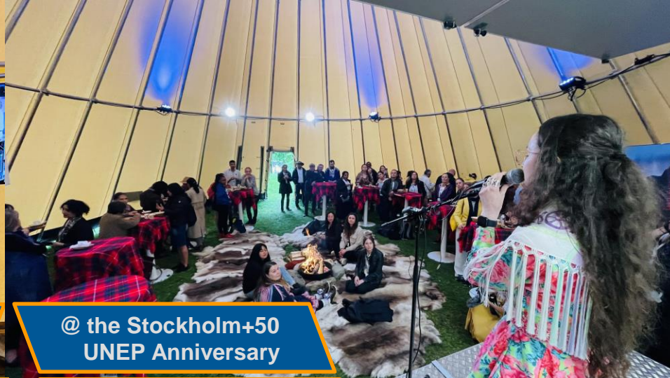
@ the Stockholm+50 UNEP Anniversary