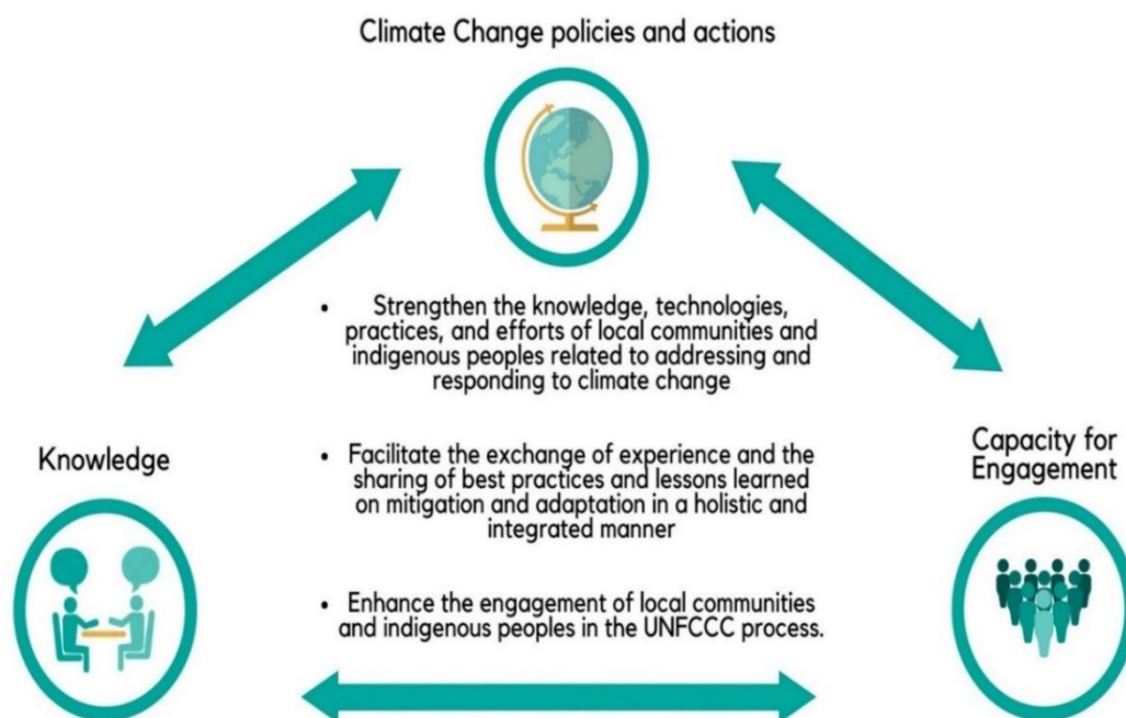
FIGURE 2: PRINCIPLE AND FUNCTIONS OF THE LCIPP

The Platform should facilitate the integration of diverse knowledge systems, practices and innovations in designing and implementing international and national actions, programmes and policies in a manner that respects and promotes the rights and interests of LCs and IPs. The Platform should also facilitate the undertaking of stronger and more ambitious climate action by LCs and IPs that could contribute to the achievement of the nationally determined contribution of the Parties concerned.