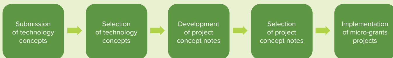
Figure 1: Operation and management process of the programme